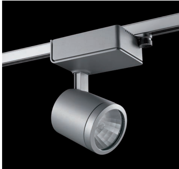
ROTADO • HIT 35W / 50W / 70W / 100W / 150W • G12