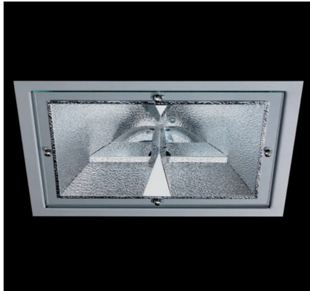
REON DA MAX • LIGHT CHARACTERISTICS • FRONT VIEW