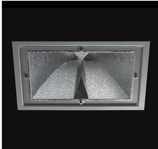
REON DA • LIGHT CHARACTERISTICS • FRONT VIEW