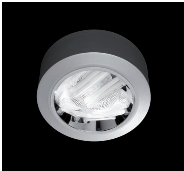
ECO UP 260 • TC-DE 2x18W • G24q2